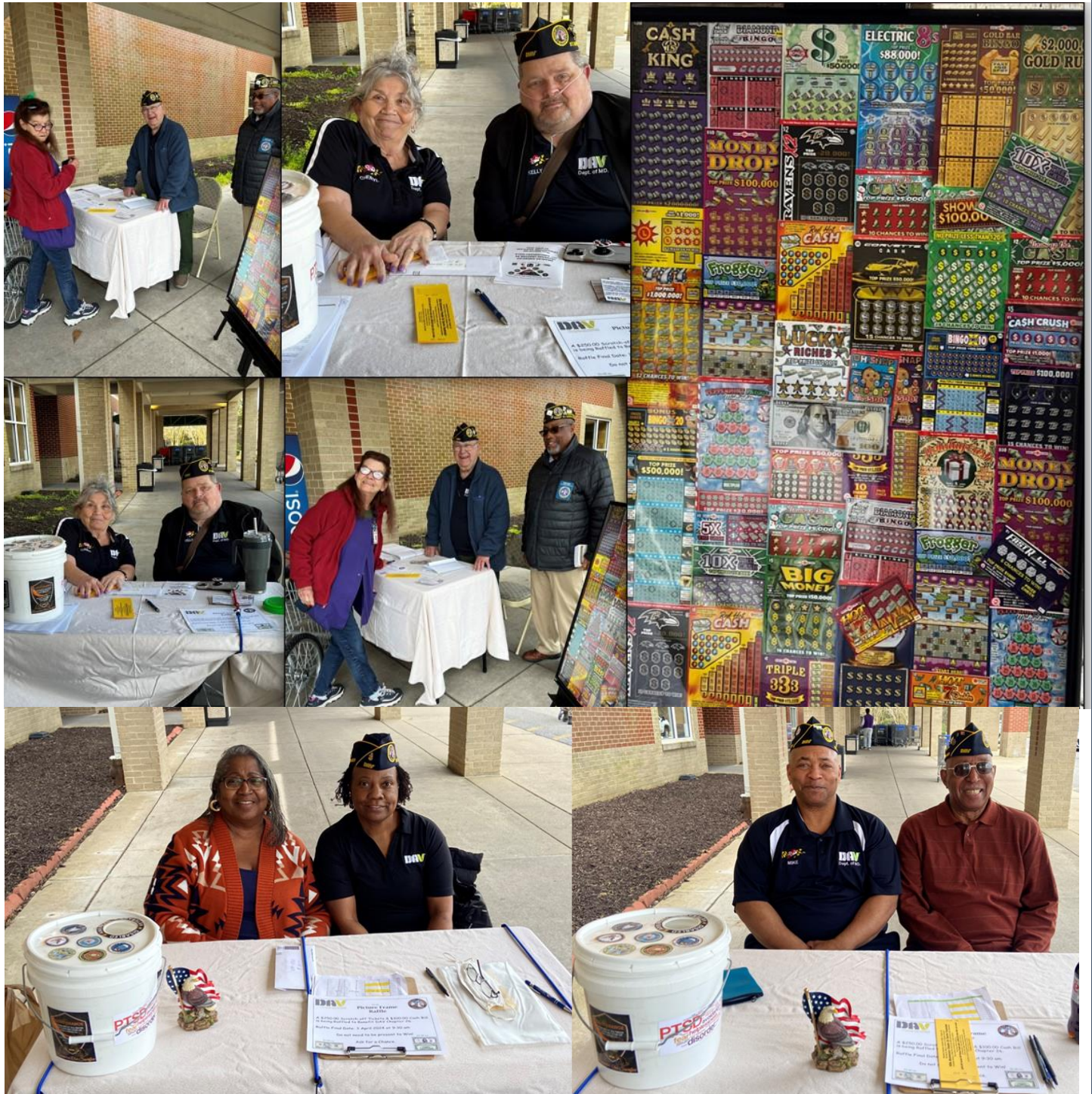
Selling raffle tickets and collecting donations